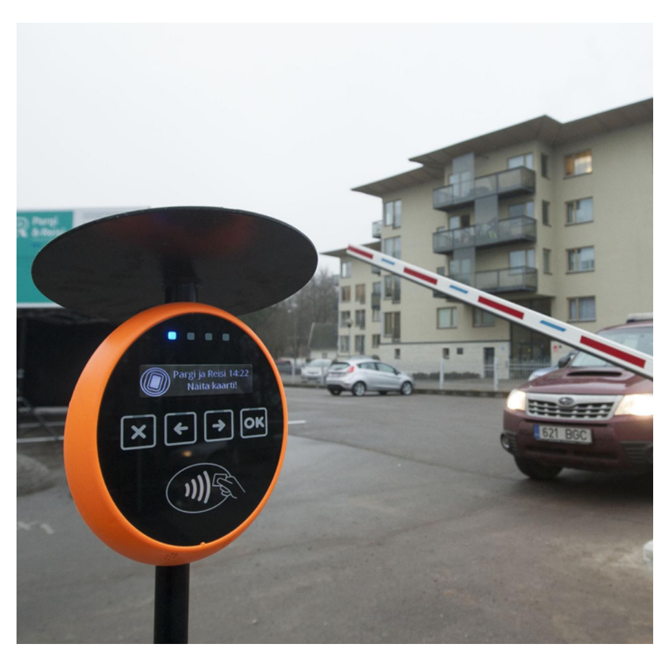
Park & Ride facilities.

In addition to improving public transport systems, communities can also encourage the use of services by promoting sustainable transportation. This can be done through public campaigns, promotions, and incentives. For example, offering discounted or free tickets to people who reduce car use can encourage more people to use public transport. Additionally, creating car-free zones in city centers, or offering incentives for cycling or walking instead of driving, can help promote sustainable transportation and reduce emissions.